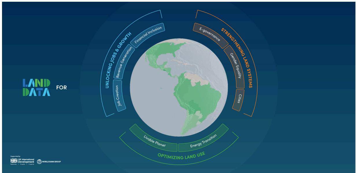
Screenshot of menu interface